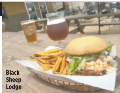
Black Sheep Lodge

All that screaming and grinding coming from the punk-oriented Black stage deserves equally tough food choices. The vegan treats from Skull & Cakebones are an obvious choice as is anything from the Black Sheep Lodge. But what goes better with Wright Bros. Brew & Brew than Fucked Up? And everyone knows that nothing goes better with hardcore (like D.C.'s Dag Nasty) than (Austin's) Pizza.